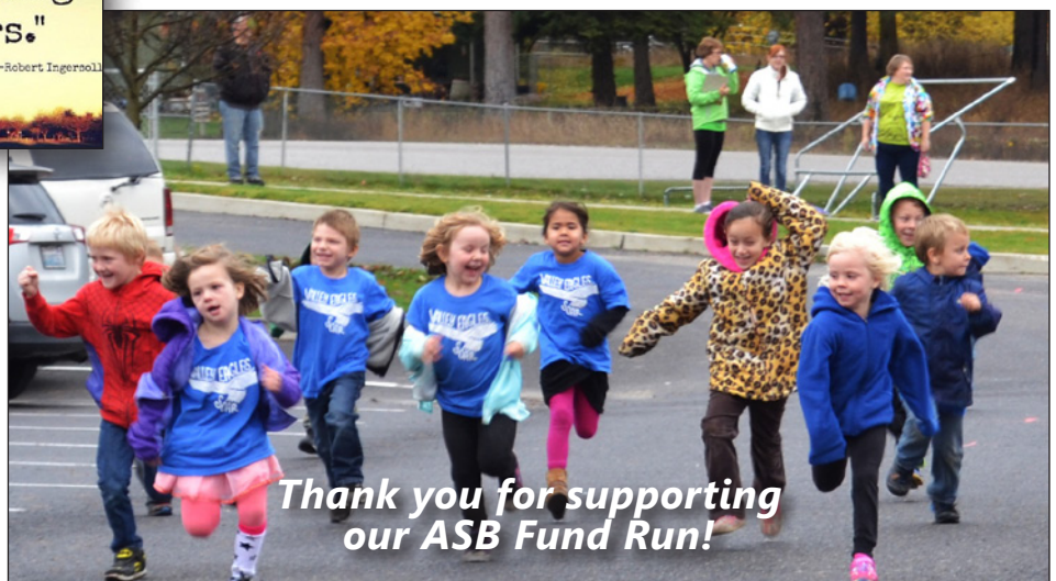
Thank you for supporting our ASB Fund Run!