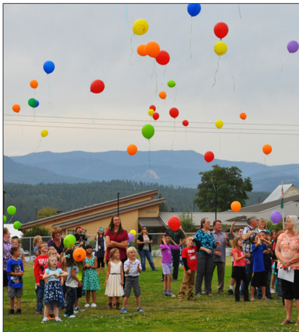
Students and staff gathered on the first day of school for a heartfelt celebration of life.

T he Valley School staff appreciate everyone who attended its annual Open House on Wednesday, September 9 th , when families were officially welcomed back for another exciting school year. The Open House is a great opportunity for parents and guardians and