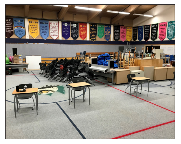
In order to meet six foot distancing requirements between students and staff, rooms were cleared of nonessential furniture, equipment and items. In the photo, above, the Multipurpose Room serves as a repository for the huge collection of extra items.

Valley School District, among many, many other districts and agen-